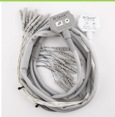
M-Quick Connector Cable