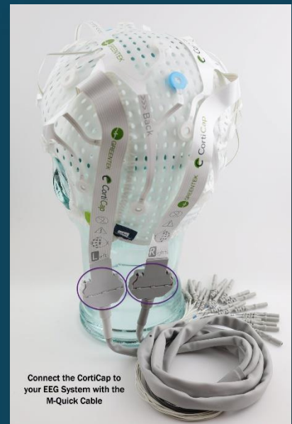
Connect the CortiCap to your EEG System with the M-Quick Cable

The CortiCap is available in two sizes: Adult (head circumference 53-62 cm) Child (circumference 45-53 cm)